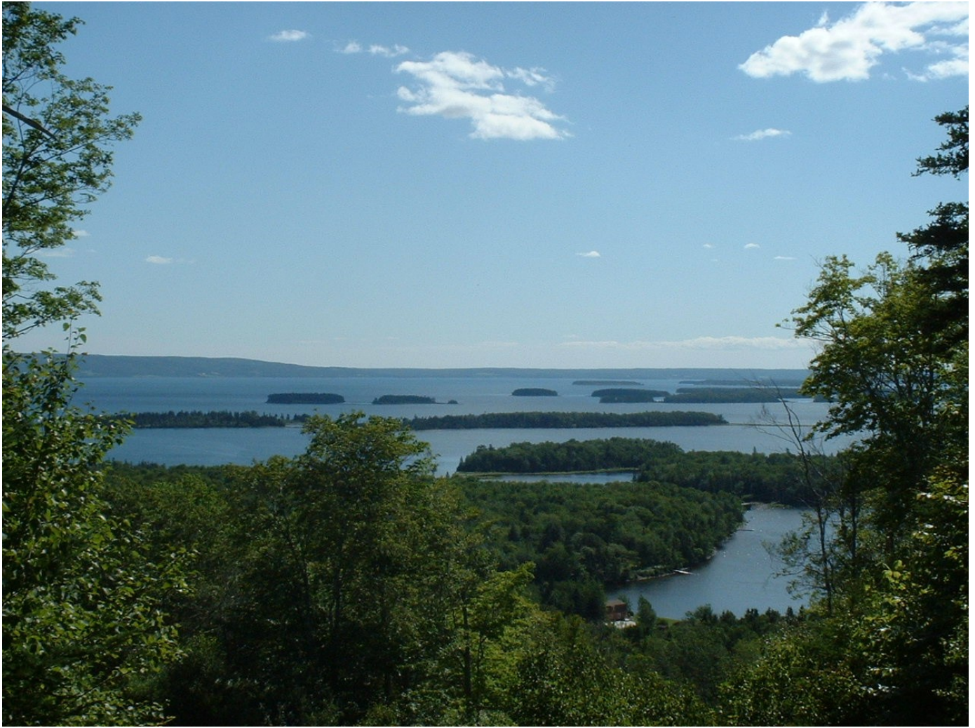
This could be your hillside estate with outstanding views over the Bras d'Or Lake, 'Nova Scotia's Golden Sea'

Million Dollar panoramic views over Bras d'Or Lake, islands, peninsulas and rolling hills