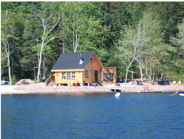
Cute cottage belongs to second neighbor

Aerial photo – Lot 2 is situated between the road and the end of the bay. Lot 1 is on the other side of the road to the northwest. - Boat, swim, waterski, canoe, kayak right from your lakefront. Excellent cruising waters in neighboring bays and the open waters of the Bras d'Or Lake.