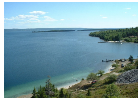
Beach and Wharf in Marble Mountain

80 acres, more or less, are situated to the northwest along the road and a 2.39 acre parcel is located between Marble Mountain Road and the lake. There is a 66 foot (20 m) wide right of way from the public road to the lakeshore.