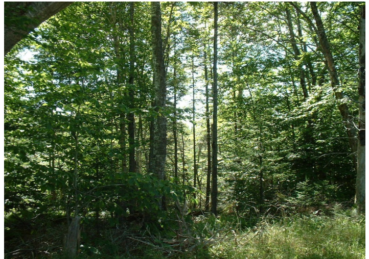
Good stand of trees on the property