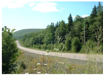
Roadfront on Marble Mountain Road