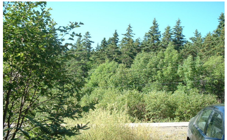
Entrance to lakefront property