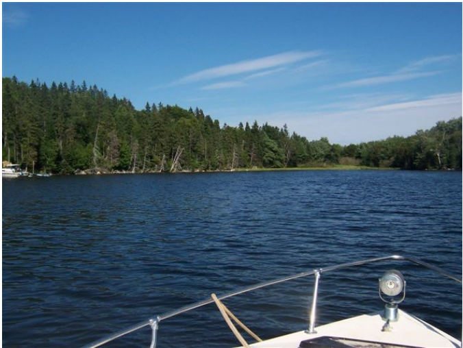
Cruise to your lakefront property at the end of the Cove